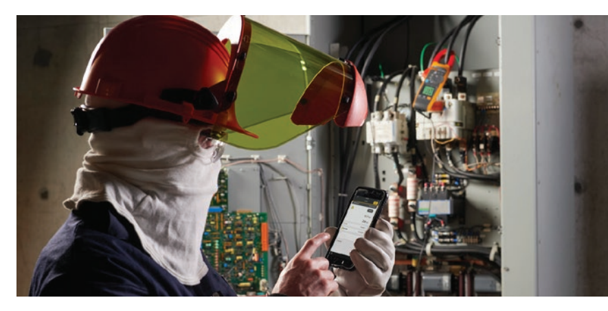
Fluke Connect allows measurements to be sent to a smartphone for logging, collaboration and analysis.

With Fluke Connect software you can remotely log, trend and monitor measurements to pinpoint intermittent faults. Fluke Connect also allows you to gather data as the basis for a preventive maintenance program.