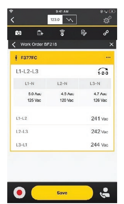
Fluke Connect pulls all data related to three-phase measurements including phase rotation and presents the full set of data for analysis at a glance.