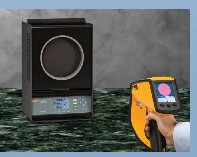
Calibrate it right the first time with a traceable, uniform, correctly-sized target.

Business decisions costing thousands of dollars are based on the results of your measurements, so they had better be right! It can be very expensive to shut down a line for repairs and maintenance, but it might be catastrophic if the shutdown is unplanned. To stand by your measurements with confidence, you should definitely have your thermometers calibrated.