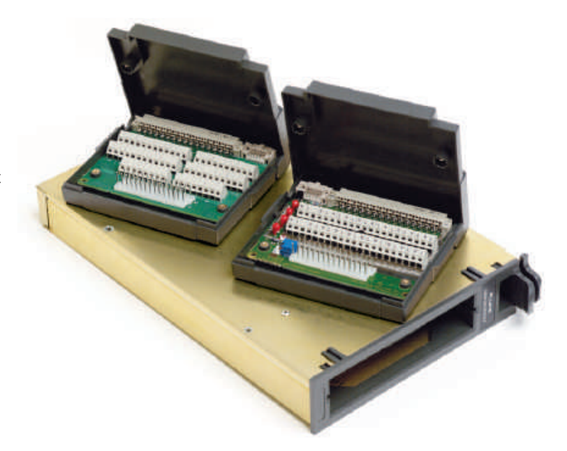
2680 Series DIO Module and Universal Input Module

Fluke's patented Universal Input Module is included with all Fluke data acquisition products, providing unparalleled thermocouple accuracy and compatibility with a broad range of diverse inputs. The Universal Input Module enables you to easily measure just about any electrical or physical parameter without changing hardware or adding external signal conditioning. You can connect any combination of dc voltage, ac voltage, thermocouples, current, RTD, resistance (2- or 4-wire), or frequency measurement inputs directly to the input