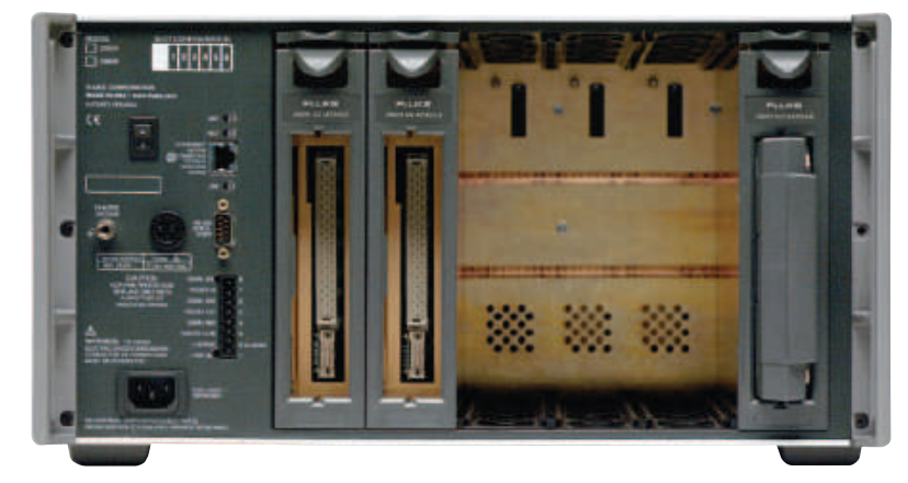
Easy access to expansion slots and rear panel

Microsoft Internet Explorer 4.0 or later