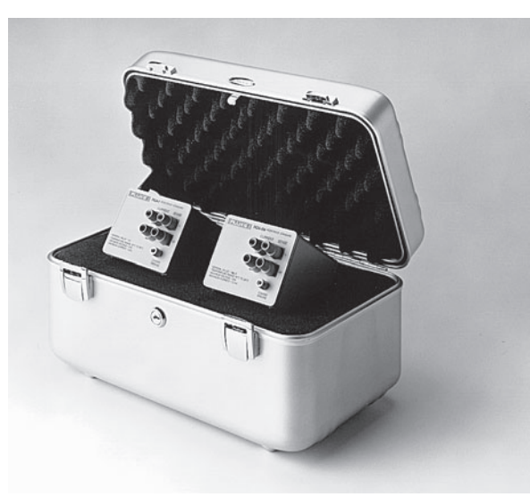
Optional 742A-7002 transit case

742A-1 1\Omega Resistance Standard 742A-1.9 1.9\Omega Resistance Standard 742A-10 10\Omega Resistance Standard 742A-25 25 \Omega Resistance Standard 742A-100 100\Omega Resistance Standard 742A-1k 1 k \Omega Resistance Standard 742A-10k 10 kΩ Resistance Standard 742A-19k 19 k \Omega Resistance Standard 742A-100k 100 k \Omega Resistance Standard 742A-1M 1 M \Omega Resistance Standard 742A-10M 10 M \Omega Resistance Standard 742A-19M 19 MΩ Resistance Standard 742A-7002 Transit Case, holds two units