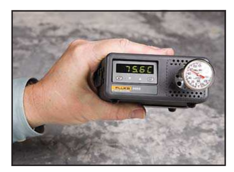
Take the 9100S anywhere. It's the smallest dry-well in the world.

Since we introduced the world's first truly handheld dry-well, many have tried to duplicate it. Despite its small size (57 mm [2^{1/4} \text{ in}] high and 127 mm [5 in] wide) and light weight, the 9100S outperforms every dry-well in its class in the world.